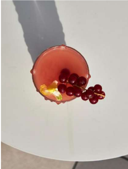
ELIA BAR FISMULER ATTIKO